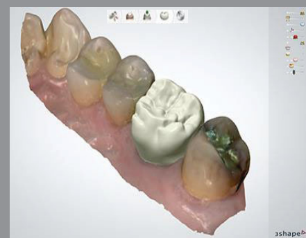
Image 4– Simulation of the final restoration with 3Shape TRIOS® software