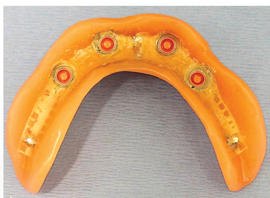
Fig. 4 Pink males (retention force 3 lbs) inserted in metal housings