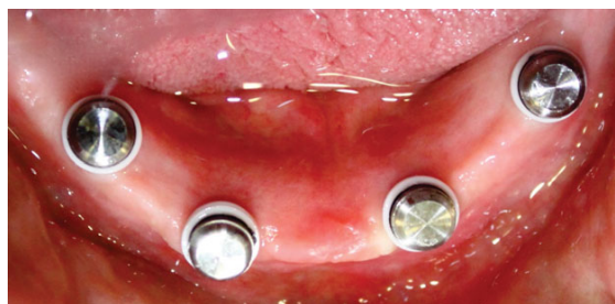
Fig. 3 Metal housings and undercut blockers seated on LOCATORS prior to chairside fixation