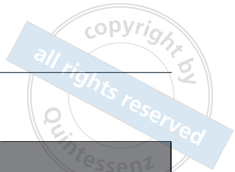
Table 1 Classification and protection of common procedures in oral and maxillofacial surgery.