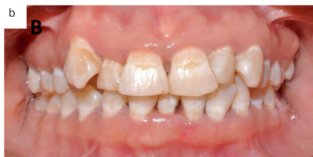
Fig 3 Patient 1, extraoral (a) and intraoral (b) condition at day 7; no sign of facial swelling/oedema.

This alteration may lead to an inappropriate or excessive activation of the complement classical pathway and to an excess of bradykinin release. 15,16 The subsequent increase in vascular permeability induces local oedema, which represents the main clinical manifestation of this syndrome. Episodes may occur spontaneously, or be induced by trigger factors including dental procedures or local anaesthesia. 2,6,28,41