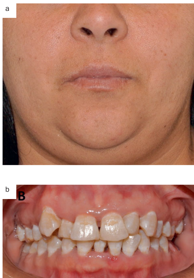
Fig 2 Patient 1, extraoral (a) and intraoral (b) condition at day 3; no sign of facial swelling/oedema.

fective approaches of non-surgical periodontal therapy are reported in the literature 21 : (a) conventional scaling and root planing (SRP), performed at one quadrant or sextant per week; (b) full-mouth scaling (FMS), ie, scaling and root planing of the whole mouth performed within 24 h; and (c) full-mouth disinfection (FMD), ie, scaling and root planing of the whole mouth performed within 24 h plus tongue brushing and adjunctive antiseptic administration including rinsing of the mouth, pocket irrigation and spraying of the tonsils.