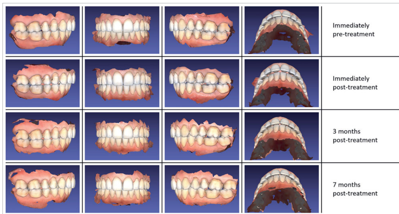
Fig 1 Overview of intra-oral scan images of patient 1.

Recently, a paper by Tew et al 19 described two case reports in which localized posterior tooth wear was treated using the posterior Dahl concept. However, as far as the current authors know, the application of the posterior Dahl concept has not been examined in larger case series or retrospective studies. The aim of the present retrospective case series is to describe the clinical outcomes (re-establishment of occlusion, mandibular midline deviation, occlusal changes, and restoration failure) as well as the levels of patient satisfaction (pain, chewing, biting, and speech problems) following the application of the posterior Dahl concept for the management of localized posterior tooth wear in a sample of nine patients where complete documentation was available.