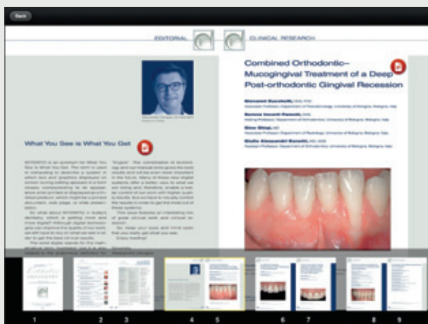
Fig 1 A screen shot of what you will be able to see on smartphones and tablets. You will be able to scroll to the article you want to read, as well as being able to send the title, author names and abstract to other people who might be interested in viewing the article.