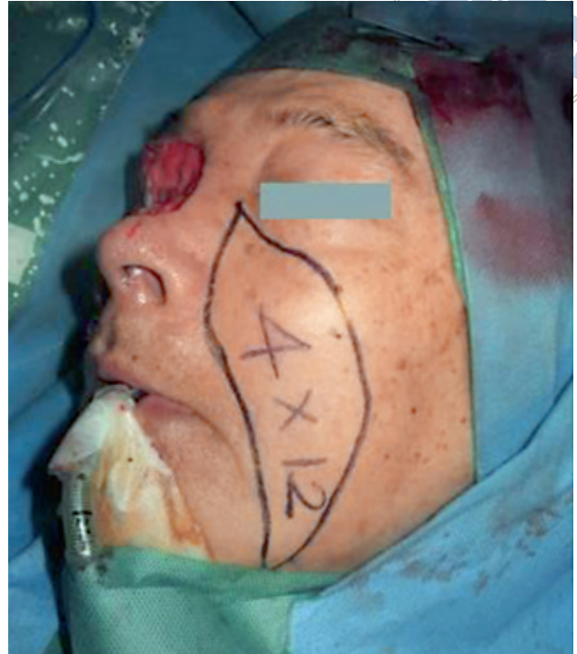
Fig 2 A retroangular island flap is outlined in the contralateral orbitonasolabial region.