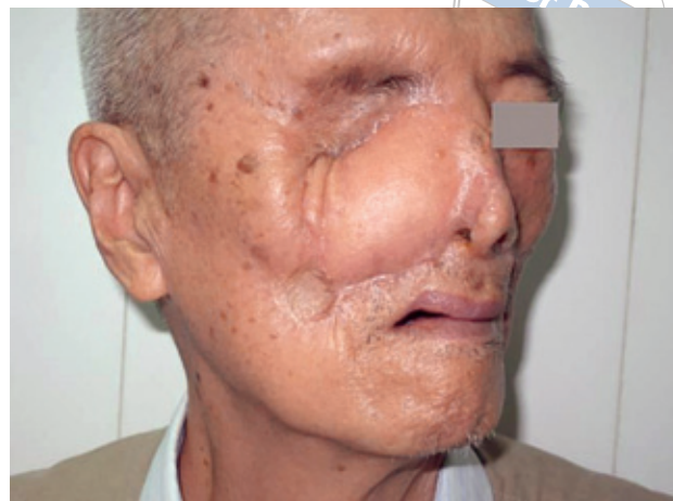
Fig 5 Postoperative photograph at 11 months after the defect was repaired.

A skin incision was made to raise the island flap base on the retroangular vessels caudocephalically. At the level of the upper lip, the branch of the superior labial artery originating from the distal facial artery was exposed and ligated. The anastomosis between the angular and lateral nasal arteries was coagulated carefully with bipolar cautery. On the lateral border of the flap, somewhat inferior to the ala of the nose, the facial vein was also coagulated. Oral mucosa and buccal skin were dissected in the oral cavity, and a full-thickness retroangular island flap containing the angular vessel in the pedicle was then harvested (Fig 3). The midfacial lesions and any other involved tissue were removed completely (Fig 4). The full-thickness flap was then rotated approximately 75 to 90 degrees and provided both skin and mucosa for the midfacial through-and-through defects. The donor site was closed directly and the suture was hidden in the nasolabial fold.