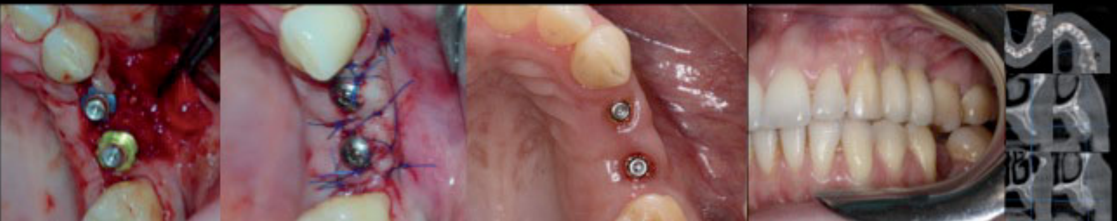
Fig. 14, 15 e 16 - Intraoperative photographs (surgery 2).

After 7 months, surgery for placing two implants (4/10 and 4.5/10 BTI) was performed with the removal of the osteosynthesis screws. At the end of 3 months, these same implants were rehabilitated with metal-ceramic fixed prosthesis.