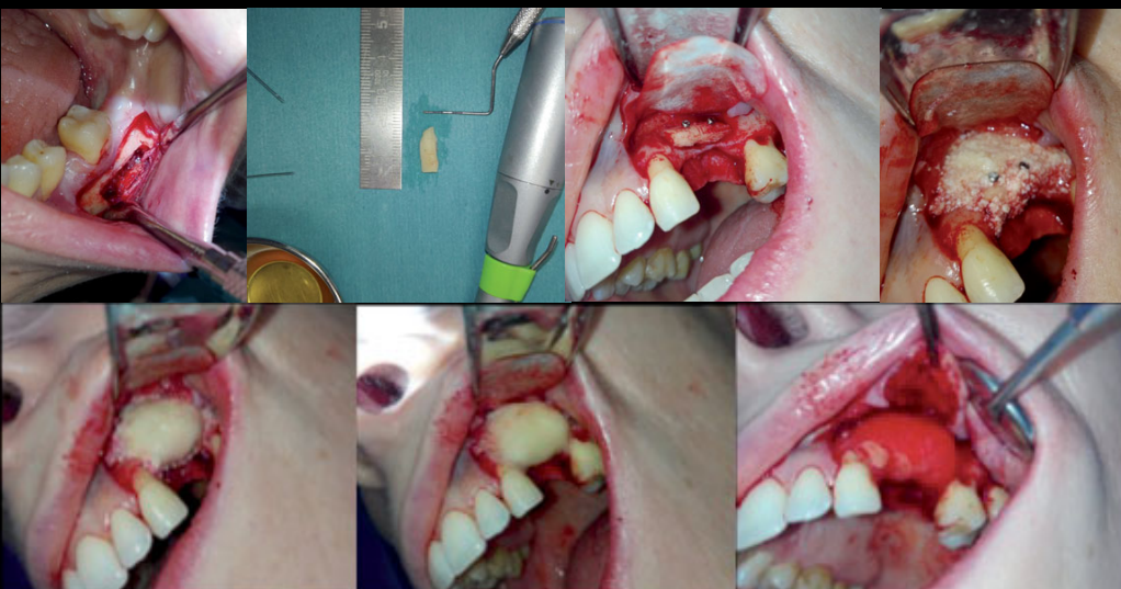
Fig. 7, 8, 9, 10, 11, 12, 13 - intraoperative photographs (surgery 1).