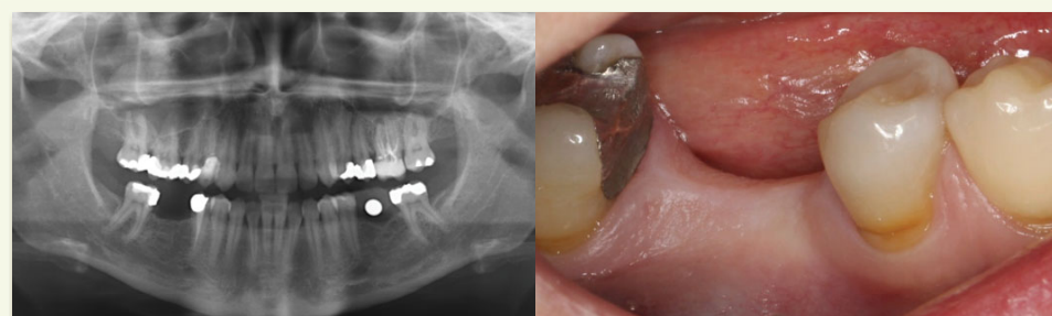
Single tooth replacement | initial situation: Orthopantomography (OPT), clinical

We see the iSy implant system as a complementary implant for standard indications. At a consistent application of this concept, cases, primarily in older patients with the clinical finding of single-tooth gaps or edentulous jaws, to be treated with implant-prosthetic procedures, which could not have been treated otherwise, mainly for financial reasons. Any modification of this standardized simple implant-prosthetic treatment leads to extra effort and increases costs. This is contrary to the innovative basic idea of this easy implant-concept.