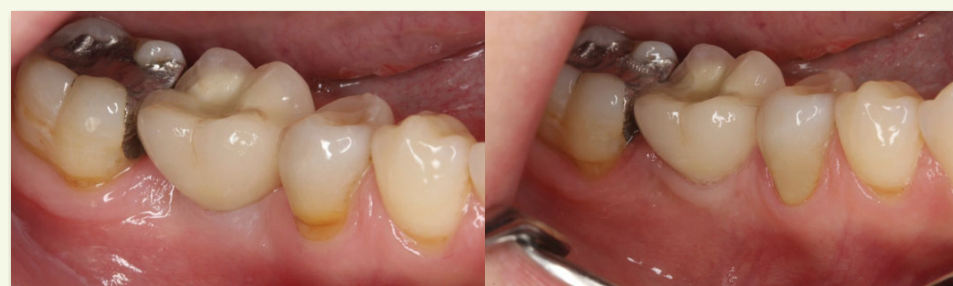
Single tooth replacement | Prosthodontics: completion, 1-year-situation