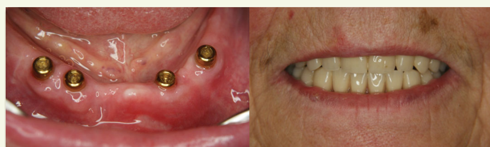
edentulous mandible | Prosthodontics: clinical with Locator®, Overdenture view