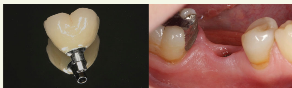
Single tooth replacement | Hybrid-abutment-crown, emergence profile