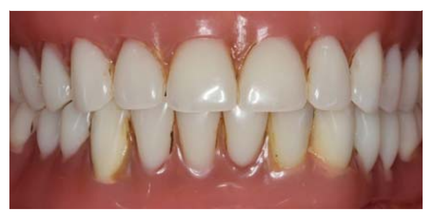
Figure 2 Pre-treatment clinical situation

Knowledge about biomechanics of dental implants has progressed and implant materials, surfaces and design have evolved accordingly over time. This leads to overcoming the dogma of achieving higher stability with long and wide implants [15]. Also, results of current studies appear to show promising evidence for the use of 4 mm short implants. Varying treatment protocols for the use of extra short implants in the mandible have been described.