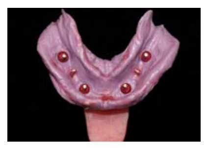
Figure 5 Lower jaw, impression