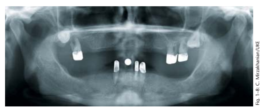
Figure 1 Pre-treatment standard radiograph

Another solution to avoid complex bone augmentation is the insertion of implants with reduced length to allow more patients to benefit from implant treatment with higher patient comfort. Implants with a length of 4 mm are the shortest currently available.