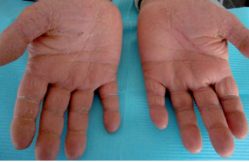
Fig 1 and 2: Palmo-plantar keratosis in PLS

The aim of this systematic review was to evaluate the outcome of the reported therapy regimens of PLS-associated periodontitis and to provide an evidence-based protocol for clinicians for treating periodontitis in these patients.