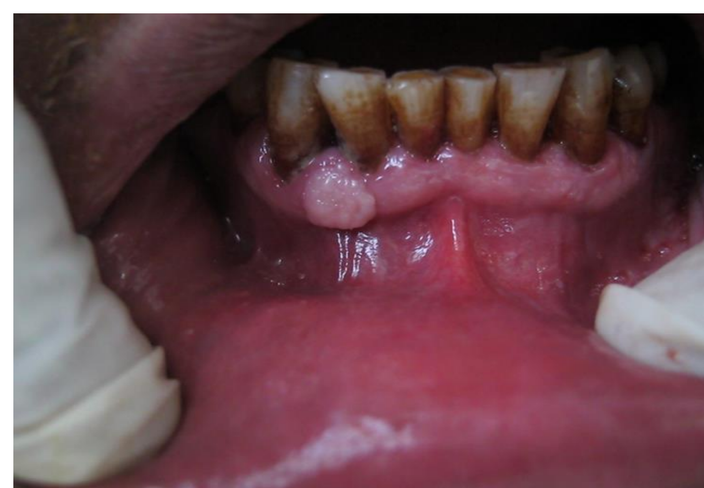
Figure 2: Gingival epulis