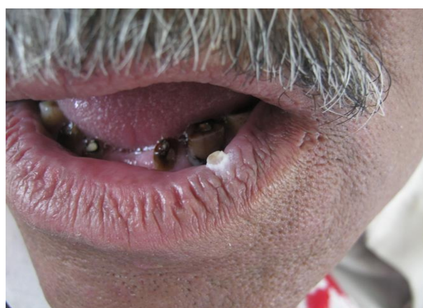
Figure 1: Papilloma

The mean age of the participants was 64.89 years. A total of 54.5% of the participants were Khat chewers and 23.8% were smokers. A total of 67.3% of the participants were diagnosed with at least one OML. The most common lesions were fissured tongue (38.6%), tumor and tumor-like lesions (20.8%) and Khat-associated white lesion (5.9%). The frequency of tumor and tumor-like lesions was significantly higher among smokers (45.8%) than none- and/or ex-smokers ( P < 0.01 ). Likewise, the frequency of oral tumors was also higher in males than females and among Khat-chewers than none chewers, though this was not statistically significant.