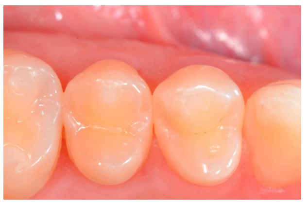
Figure 2 Situation after filling the trough-shaped defects with flowable composite. The cusp tip of the canine was supplemented with a highly viscous composite.