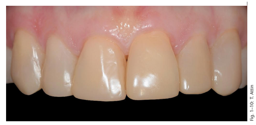
Figure 10 Labial view of the anterior teeth restored with direct composite.

posterior region with direct occlusal composite build-ups. The highly viscous composite material used for the restoration was filled into the splint in a quantity corresponding to the missing tooth structure and heated to 68 °C for 5 min under light protection on a heating plate (Calset, Ad-Dent, Danbury, USA). Heating reduces the viscosity of the composite material, thus facilitating the placement of the splint on the dentition. Laboratory tests have shown that heating the composite does not affect the material properties [31]. The short vertical design of the splints allows excess material to flow off well when the splint is placed and most of