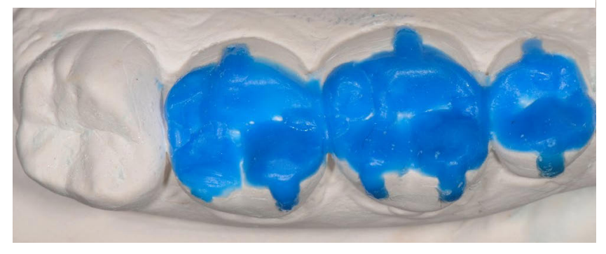
Figure 5 Wax-up of the posterior teeth with omission of the last molar, which was later built up freehand. The "drainage grooves" modeled buccally and lingually with wax at the time are no longer provided by the authors today.

the often extensive restorations during the night by occlusal protective splints against the effects of nighttime, uncontrolled teeth grinding.