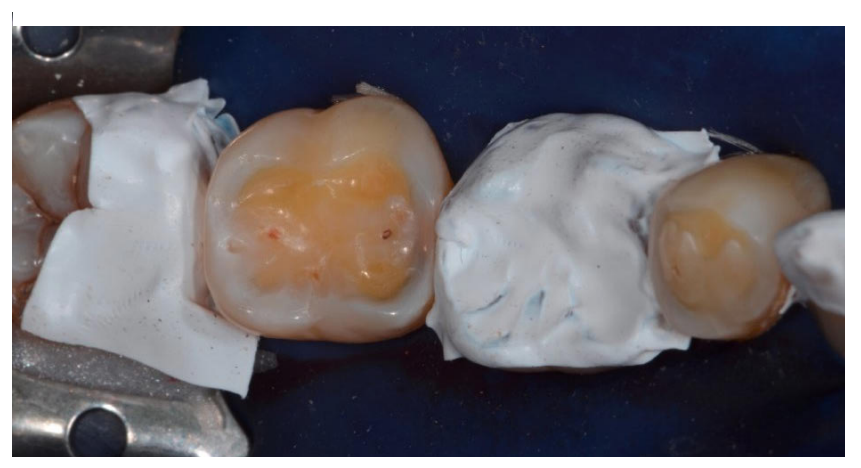
Figure 7 Isolation of the adjacent teeth with Teflon tape.

tration in habitual intercuspidation was performed. In the dental laboratory, the ideal occlusion was waxed up by approximately 2 mm with the anterior teeth blocked. During the fabrication of the wax-up models, the anterior teeth and the posterior portions of the terminal molars were not built up (Fig. 5). On these models, two translucent transfer splints each were fabricated from transparent acrylic for the maxilla and the mandible, which were relined with a transparent silicone-based bite registration material (Fig. 6). The nonwaxed areas later allow stable support of the splints in the patient's mouth.