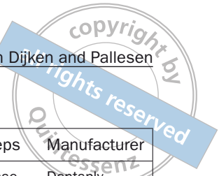
Table 1 Resin composites and adhesive system used