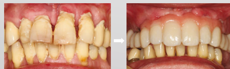
Fig. 5: Intraoral situation before (left) and after (right) treatment