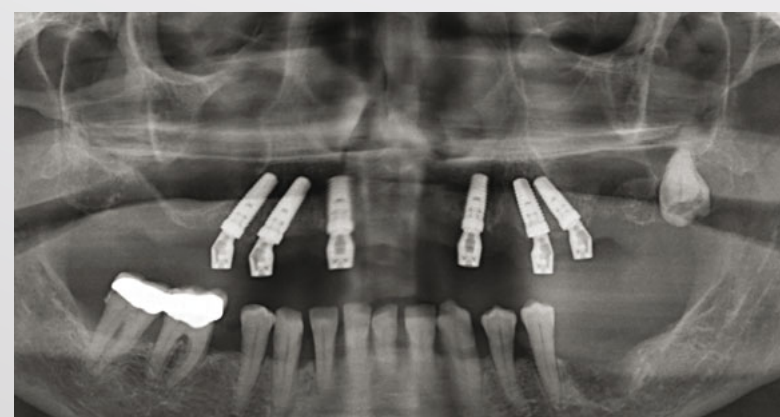
Fig. 4: Orthopantomogram taken after implantation

After implantation the temporary restoration can be finished by veneering titanium caps optionally on the bar lab analog on a working model or on the definitely in the implant inserted bar abutments. The complete temporary restoration is then fixated to the bar abutment with prosthetic screws. The final delivery of the temporary restoration can be scheduled only a few hours after insertion of the implants.