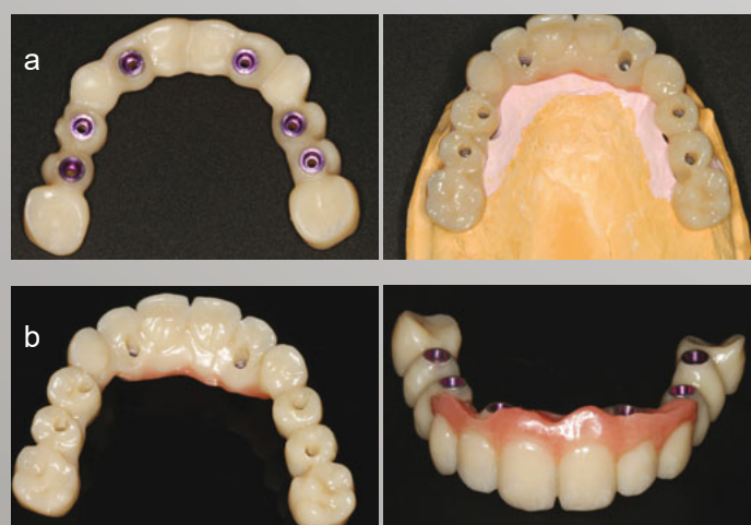
Fig. 3: Laboratory steps: titanium caps are placed into the temporary restoration by veneering after adaption on the working model (a), finished temporary restoration (b)