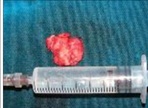
Fig. 4 Fig. 5