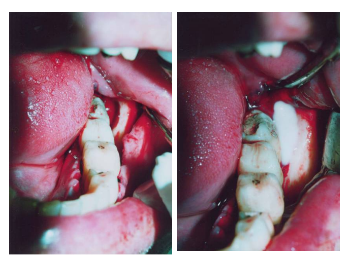
Fig. 2 The cyst removed. Fig. 3. The defect filled with Note the sharp margins of the Osteoinductal® bone defect.

The healing occurred uneventful. Sutures were removed two weeks after the surgery, no dehiscence of the wound was noted.