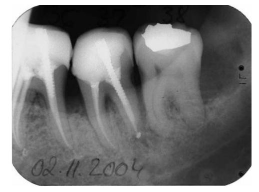
Fig.1 Radiographic image of the regio 38. Note the diffuse radiotransparent contour on the distal aspect of 38.

The 42-year old man, moderate smoker, suffering of chronic generalized severe periodontitis was first seen in a private periodontal practice. The radiologic examination revealed both on panoramic as on retroalveolar incidence a semicircular radiotransparent image, with relatively diffuse borders, located distally to the tooth 38 in anterior aspect of the ascending ramus of the mandible (Fig.1). Despite the relative lack of periodontal support for the distal root on its distal aspect (PPD = 10), the tooth 38 showed moderate mobility. The patient underwent initial therapy according to the One Stage Full Mouth Disinfection concept (Quirynen, 1995). Root canal treatments were performed using the rotary system ProTaper® and the root canal filling system Thermafill® from Dentsply-Maillefer, and the coronal parts of the teeth were rebuilt using intracanalar screws and core-composite materials. The patient was reevaluated four weeks later and persistent periodontal pockets of more than 5 mm were found in all sextants. Periodontal surgery aiming to reduce the pockets was decided on the upper arch and on both mandibular quadrants. As the intriguing semicircular radiotransparent image persisted, the patient was referred to the Department of Periodontology of the Faculty of Dental Medicine of the Victor Babes University of Medicine and Pharmacy of Timisoara, where the periodontal surgery for the left lower quadrant was scheduled.