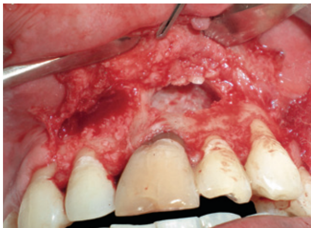
Fig 1 Defect following debridement.