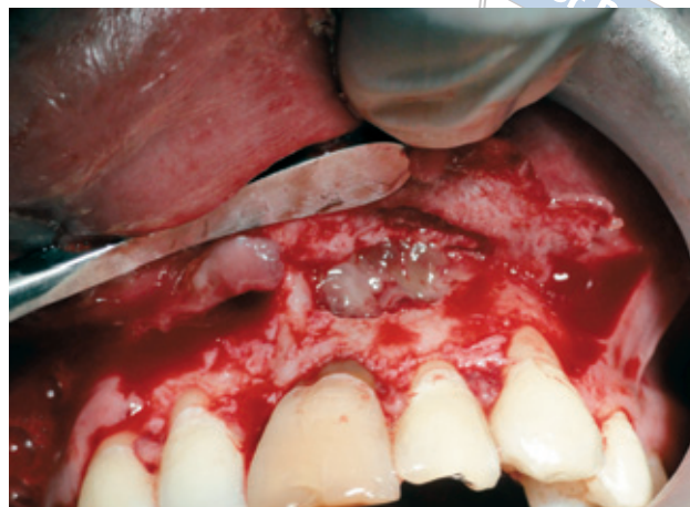
Fig 2 Placement of the PRF clot into the defect.

The procedure was explained to the patient in his own language and informed consent was obtained. The initial step of the treatment plan was to complete root canal therapy. The surgical protocol included a routine medical history followed by blood investigations. The procedure included the reflection of a full thickness mucoperiosteal flap by sulcular incision and two vertical relieving incisions. Debridement of the tissues at the defect site was followed by irrigation with sterile saline solution (Fig 1). Root resection and cold compaction was done at the apical end of the filling. The PRF clot was carefully placed till the entire cavity was filled (Fig 2). Wound closure was obtained with a 3-0 black silk suture and covered with a periodontal dressing. Analgesics, antibiotics and a 0.2% chlorhexidine mouthwash was prescribed for five days post surgery. The sutures were removed after 7 days. The patient was reviewed at regular intervals of 1 week, and 1, 3, 6 and 9 months. During the review, occlusal radiographs were taken. These follow-up visits included routine intraoral examinations and professional plaque control, if required. The case was evaluated clinically – for oedema, postoperative pain, signs of infection, untoward reaction, wound dehiscence – as well as radiographically.