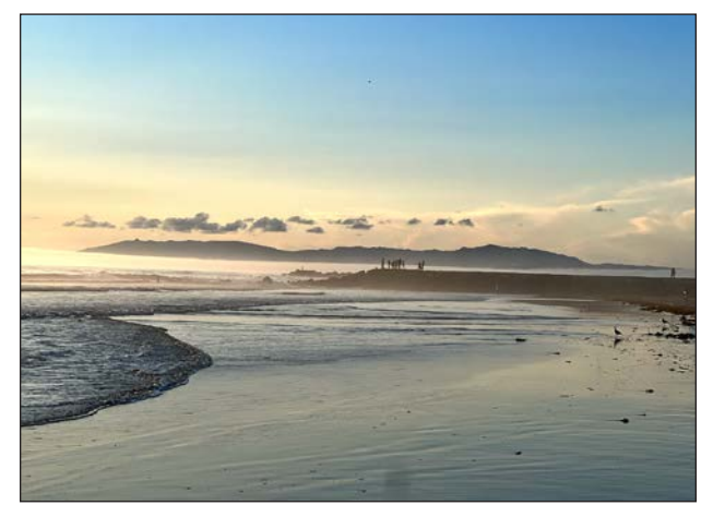
Appendix Fig 6 Ocean view from Dragão Vermelho beach, Lisbon, Portugal.