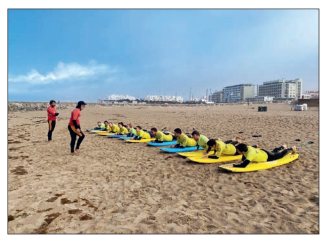
Fig 3 Surf lesson on day 2. Participants following the surf instructor's guidance before practicing in the ocean.

one by one in front of the entire audience, giving the group the opportunity to get to know each other better. After these introductions, participants were asked to assess their satisfaction with their own presentations. Additionally, the trainers provided feedback and suggestions.