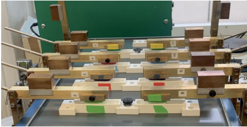
Fig 2 Experimental set-up in the brushing machine.

tom-designed software, and the difference between the baseline profile and final profile was considered as the resulting abrasive wear of enamel or dentin. As determined in a previous study, the profilometer used had a minimum measurement limit of 0.105 \mu\text{m} . 3