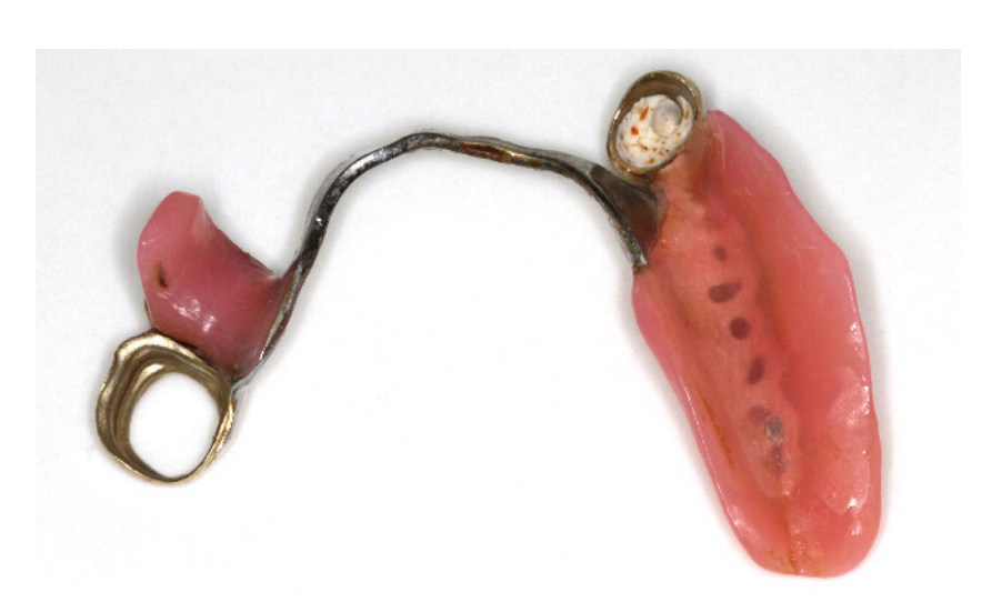
Figure 5 View of the base of the removable denture and a secondary part filled with chewing gum in the region of tooth 33 and a ring telescope on tooth 47

17 was missing, whereas the lower arch was treated with removable dentures that replaced the teeth 35, 36, 37 and 46. The tooth 47 was treated with a ring telescope. The anchoring tooth 33 showed a clinically sufficient, seemingly free modulated rootanchored ball attachment (diameter of the ball-shaped head was about 2 mm) and healthy periodontal conditions (probing depth < 3.5 mm on all 6 measuring points, no bleeding on probing) (Fig. 2-4). The secondary crown in removable dentures in the region of tooth 33 was filled with chewing gum. Upon request, the patient states that he optimized the unsatisfactory retention himself with the application of chewing gum, after the pink silicone inserted repeatedly by the dentist was lost regularly. He