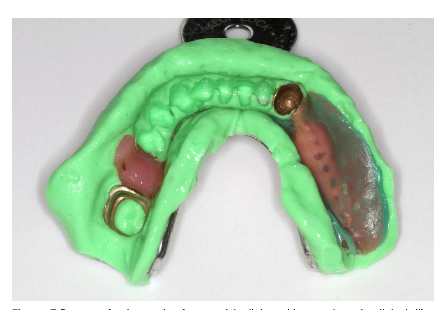
Figure 7 Denture after impression for a partial relining with a condensation-linked silicone and pick-up impression with alginate

Senden, Germany) is available in different retention strengths. According to the instruction manual of the materials used, the shore hardness amounts to either 25, 50 or 65 shore, while the pull-off forces can amount up to 2.4 or 6 Newton. Medium retention strength (retention.sil 400, Bredent, Senden, Germany) were used. Because tooth 33 was periodontally healthy, no pre-prosthetic periodontally prophylactic measures were necessary and the retention silicone was inserted chairside in the previously conditioned cavity in the base of the dentures and the root-anchored ball attachment according to manufacturer specification (Fig. 8). According to the instructions, it was not necessary to isolate the dentures