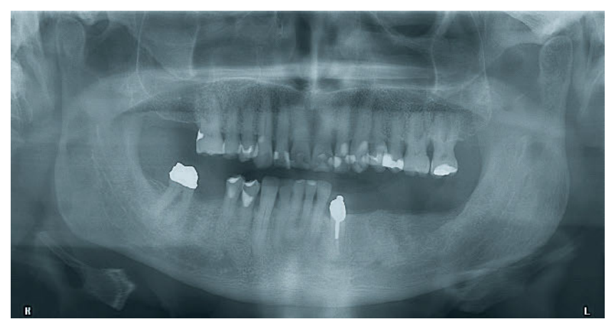
Figure 6 OPG from September 2019 shows a sufficient root-anchored ball attachment on tooth 33