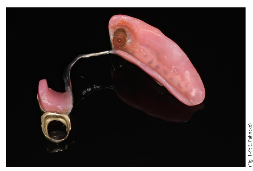
Figure 9 Base of dentures 3 months after insertion of the retention silicone, which lines the retentive part of the root-anchored ball attachment and the circular secondary part