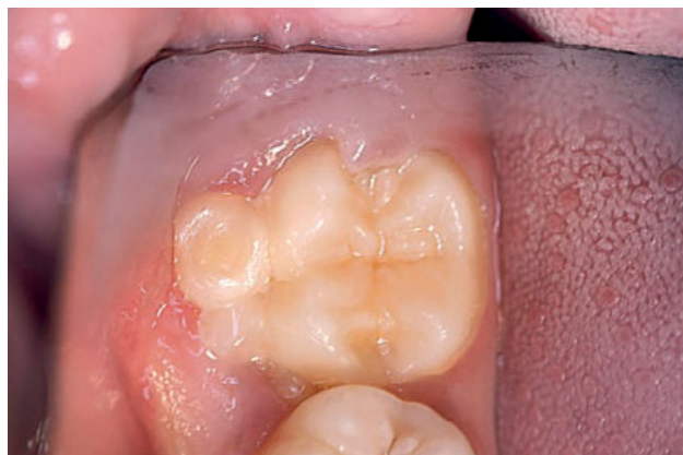
Fig 1 Clinical image of the mandibular right second molar.

Cold pulp sensibility testing (PulpoFluorane, Septodont, Saint-Maur-des-Fossés, France) revealed an exaggerated pulp response of over 10 seconds. The tooth displayed tenderness to percussion.