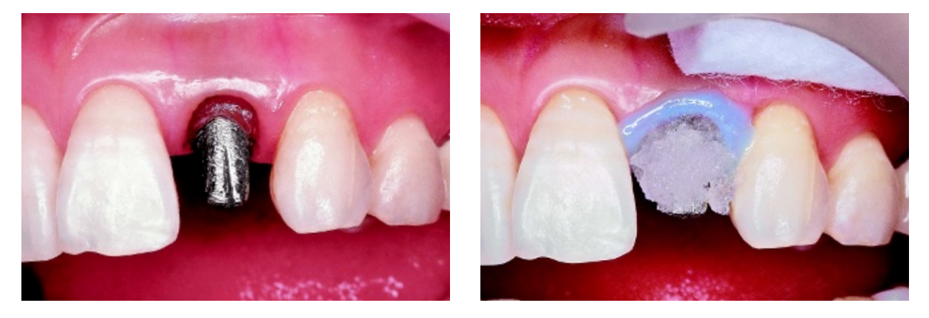
Fig. 2-18 Discoloration of abutment tooth.