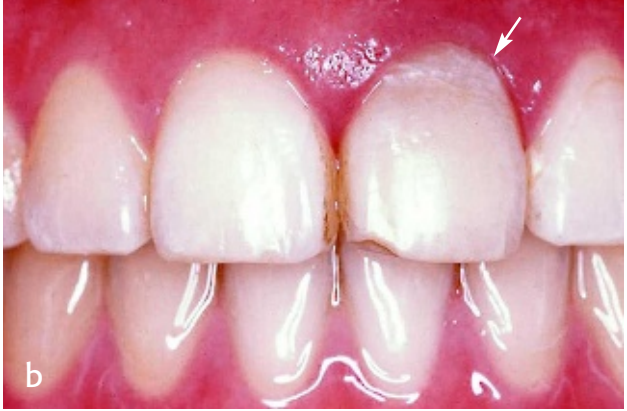
Fig. 2-16 Discoloration of the upper left central incisor.