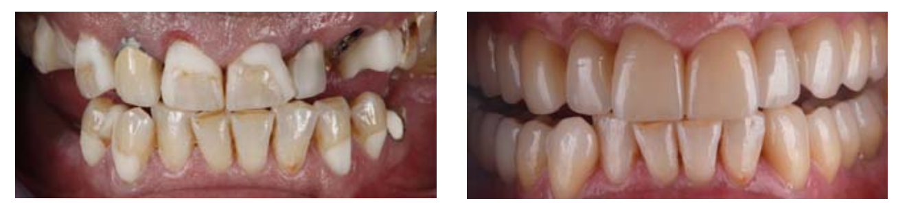
Figure 1 Clinical case a) Initial situation with teeth 12, 22 and 23 to be extracted. b) Treatment completion with FDP 11 to 13 made of vestibular veneered zirconium oxide ceramic, single crown 21 made of lithium disilicate ceramic. 22 and 23 are restored implant-prosthetically with an implant crown 23 with mesial cantilever 22 made of vestibular veneered zirconium oxide ceramic.

posterior survival rates of 99.6% and 94.7–95% after 7 and 12 years, respectively, in a cohort study and a case series [15, 52].