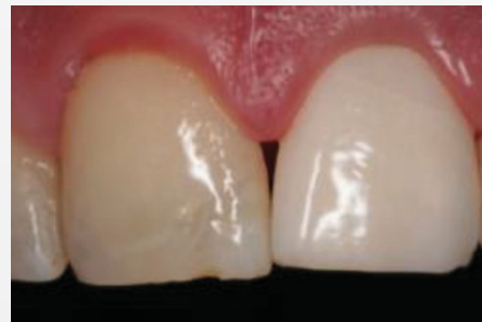
Temporary Crown 21