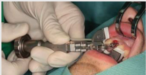
Axial extraction with Benex system 21