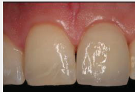
Definitely Crown 21