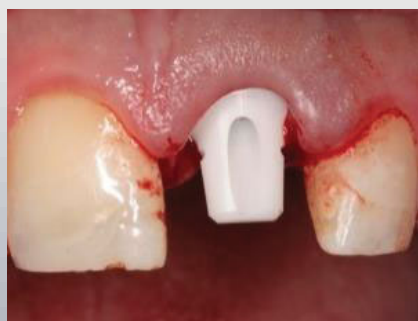
Ceramik abutment regio 21