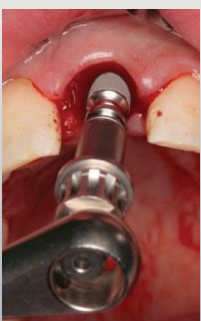
Implant position 21