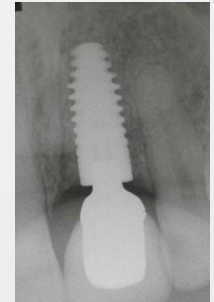
X Ray 21