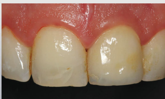
Follow up 7 years

The three-dimensional (3D) position of the osseointegrated dental implants provides favorable esthetical results and preserves the surrounding soft and hard tissues architecture.