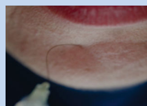
Figure 1: Mechanical Detection Threshold (MDT) was measured with a standardized set of modified von Frey filaments (Optihair2-Set®).

QST is a non-invasive, psychophysiological approach to evaluate thermal and mechanical somatosensation. The present study applied the protocol implemented by the German Research Network on Neuropathic Pain (DFNS) 1,2 in the orofacial region. Patients who had obtained an implantation in the lower jaw combined with augmentation procedures were examined by implementing a comprehensive QST protocol for intraoral use. Patients were tested bilaterally in the innervation areas of the mental nerve (chin and lip/extraoral and intraoral) and results compared to healthy controls as well as patients being implanted several years ago and patients with a neurological deficit. Thermal and mechanical tests were performed in patients with a radiographically and clinically injured nerve as well as in patients after implantation with no clinical symptoms.