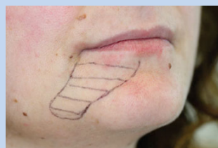
Figure 3: Mapping of the affected area.

The radiological examination showed protrusion of the implant in the alveolar nerve canal in one case treated alio loco. In the other cases proximity to the inferior alveolar canal was evident and x-rays measured using ImageJ®. Using a prospective human study design, data are presented as mean and statistical comparisons were performed using the Mann-Whitney Test or Spearman Correlation. The analysis was done with JMP® 10.0 statistical software (SAS Institute, Cary, NC, USA)