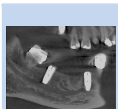
Figure 4: Cone beam CT indicating placement of the mesial implant in the inferior alveolar nerve and the distal one at the roof of the canal.

The radiological examination showed protrusion of the implant in the alveolar nerve canal in one case treated alio loco. In the other cases proximity to the inferior alveolar canal was evident and x-rays measured using ImageJ®. Using a prospective human study design, data are presented as mean and statistical comparisons were performed using the Mann-Whitney Test or Spearman Correlation. The analysis was done with JMP® 10.0 statistical software (SAS Institute, Cary, NC, USA)