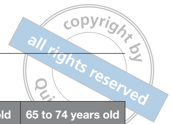
Table 2 Oral health status of 5, 12, 35 to 44, 65 to 74-year-old group people in 2005.