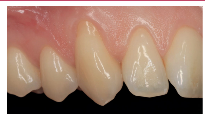
Fig. 1: A non-carious cervical lesion (NCCL) leading to dentin hypersensitivity.